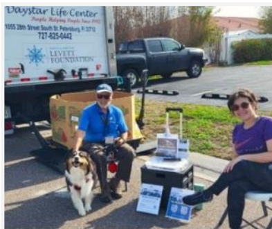
Thanks for Donating to Daystar Life Center!!

Share your photos of anything Broadwater via email infolink@broadwaterfl.org and you may see it in the Broadwater Breeze or on the website.